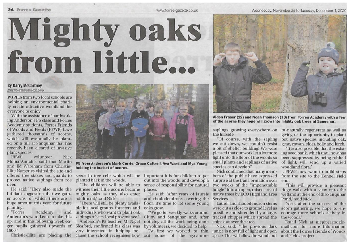
Figure 6. Forres Gazette on the pupils of Forres Academy gathering acorns with FFWF.

A number of seasonal festivals have also taken place on the land, including carol singing in the woodland on Christmas Day, and an outdoor theatre company 'The Frozen Charlotte' has been booked for the end of August 2021.