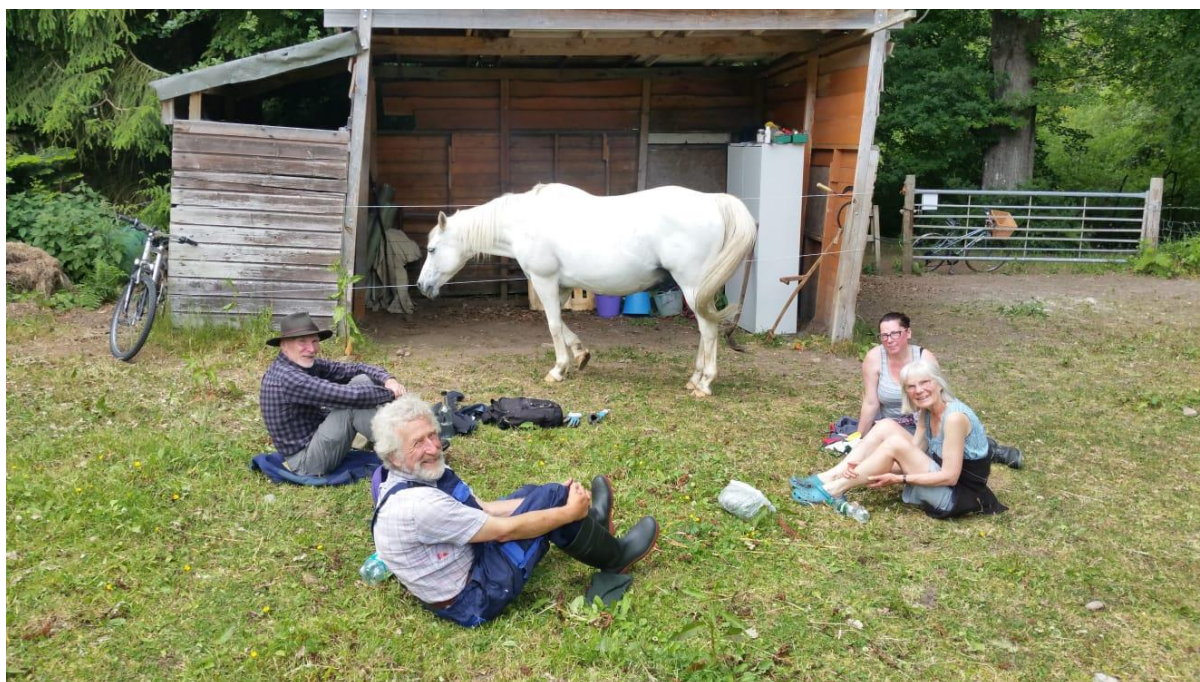
Figure 4. Tea break during a volunteering session.