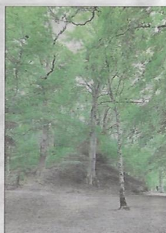
The area of woodland is to the left of the path around Sanquhar Pond.

"Other outdoor teachers might offer tutorials for all ages to increase