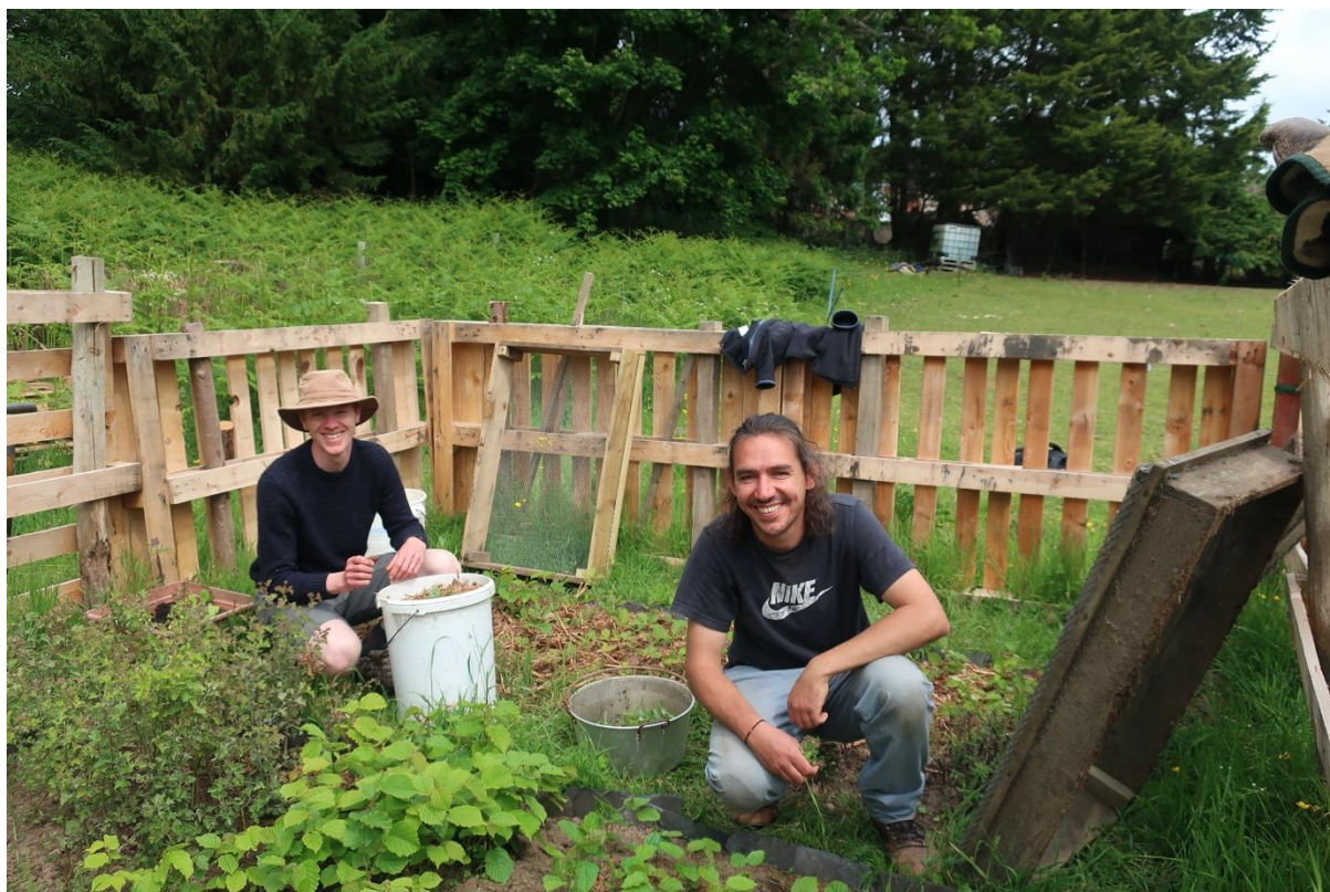
Figure 5. Tree Nursery on Kennel Field with regular FFWF volunteers.