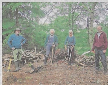
Some of the clearing crew working with tools of the trade.