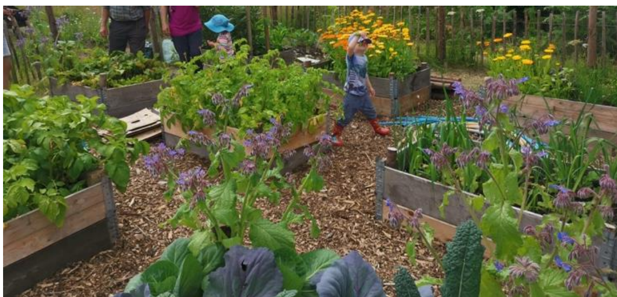
Figure 6. A blooming and productive Children's Garden.